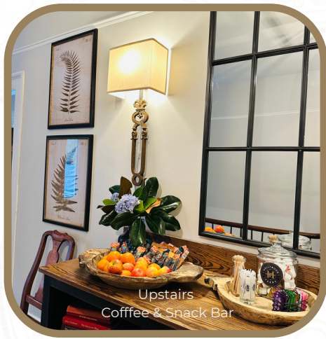
Upstairs Coffee & Snack Bar