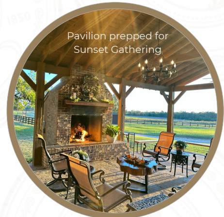
Pavilion prepped for Sunset Gathering