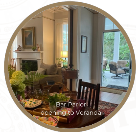
Bar Parlor opening to Veranda