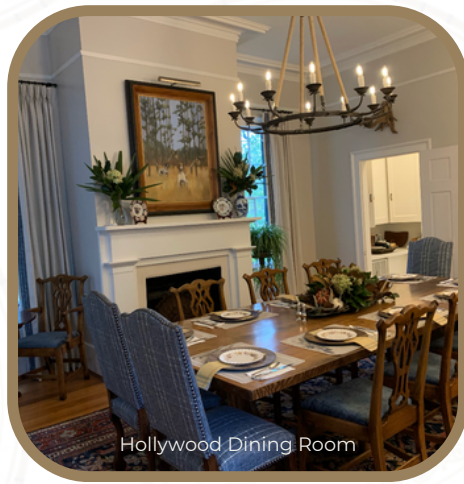
Hollywood Dining Room